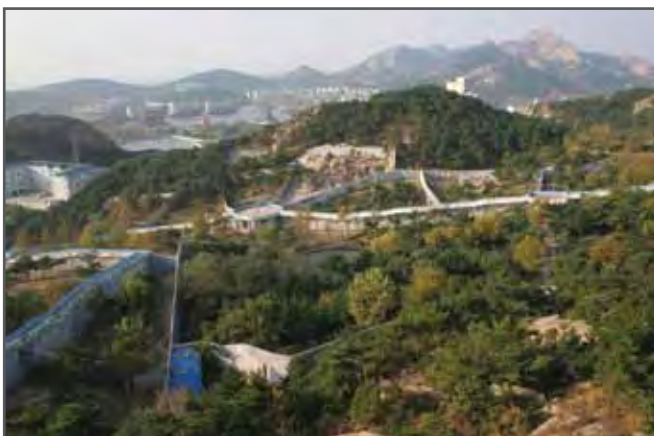
View of the large carnivore section of the zoo.

An intravenous line was set up and the elephant was maintained at a suitable level of anaesthesia with small doses of intravenous etorphine every 15 to 30 minutes. Dr Steenkamp proceeded to evaluate the damaged tusk. Two holes, dorsal and ventral to the pulp cavity, were explored with a rigid video endoscope. Only one of the two appeared to be communicating with the pulp cavity. The pulp itself seemed to be reasonably healthy, with very little sign of infection. The holes in the dentine were thoroughly cleaned and sealed with bone cement, while the pulp cavity was drilled, tapped and plugged with an implant. The end of the fractured tusk was then smoothed off with a file. The whole procedure took just over two-and-a-half hours and the elephant stood up calmly a few minutes after naltrexone was administered intravenously. We were impressed with the fact that, even before the procedure was finished, the Chinese workers had already started welding additional bars onto the gate to reduce the risk of the elephants damaging their tusks again.