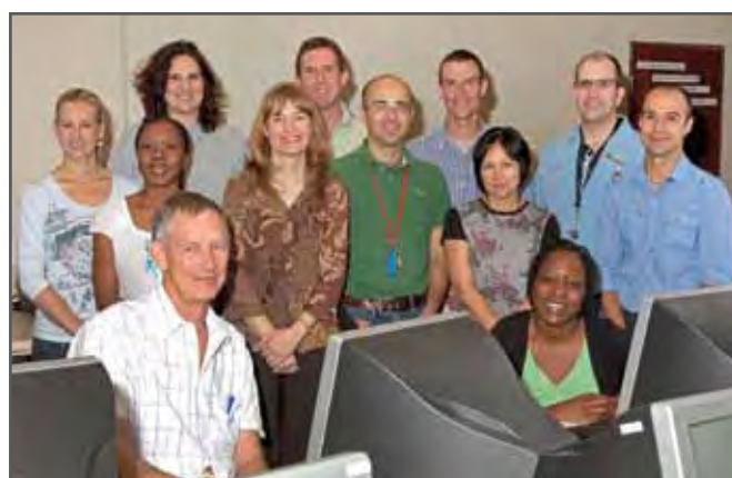
Some of the lecturers who attended the clickUP Basics training sessions.

The next clickUP Basics training opportunity at Onderstepoort is scheduled for 19 and 20 January 2011.