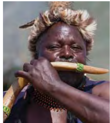
A member of the Mnsi tribe during one of their cultural days.

After extended negotiations, the Peace Parks Foundation, the Mpumalanga Tourism and Parks Agency and the University of Pretoria signed a Memorandum of Understanding to refurbish and upgrade the facility. It was agreed that the station would be developed as a research platform to provide state-of-the-art facilities for national and international researchers to conduct research into the dynamics of diseases at an interface between wildlife, domesticated animals and humans. The research would further focus on the development of transfrontier parks (peace parks), and their impact on local communities at the interface.