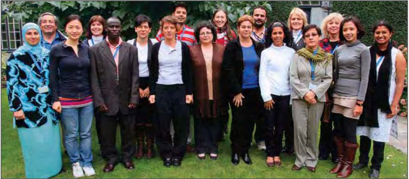
The participants of the TEL workshop in Antwerp.

Technology-enhanced learning: exploring possibilities and tools for low-resource settings