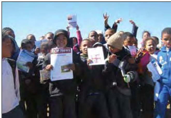
Children with the OP News during this year's Veterinary Outreach to Calvinia and Brandvlei.