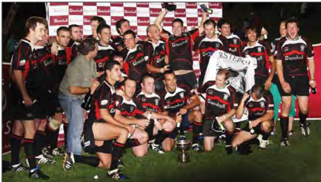
The Onderstepoort rugby team was crowned as the Steinhoff Tuks House League Champions in 2010.

After an unbeaten season last year, overshadowed by a controversial final, OP stood up once again this year, dominating the league, and finally managed to get the name Onderstepoort engraved on the Steinhoff Tuks House League trophy.